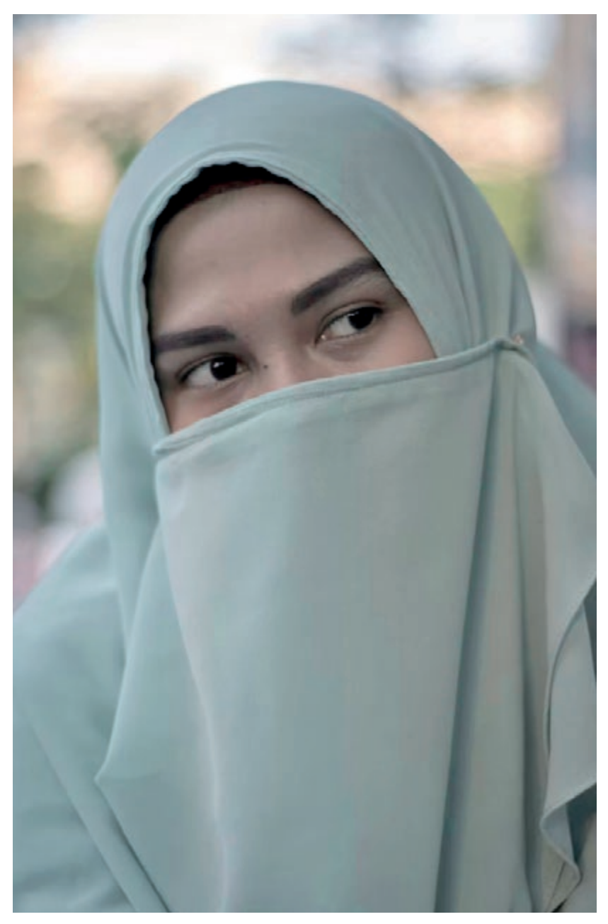
The enforced wearing of a veil is the clearest symbol of the oppression of women in Iran.