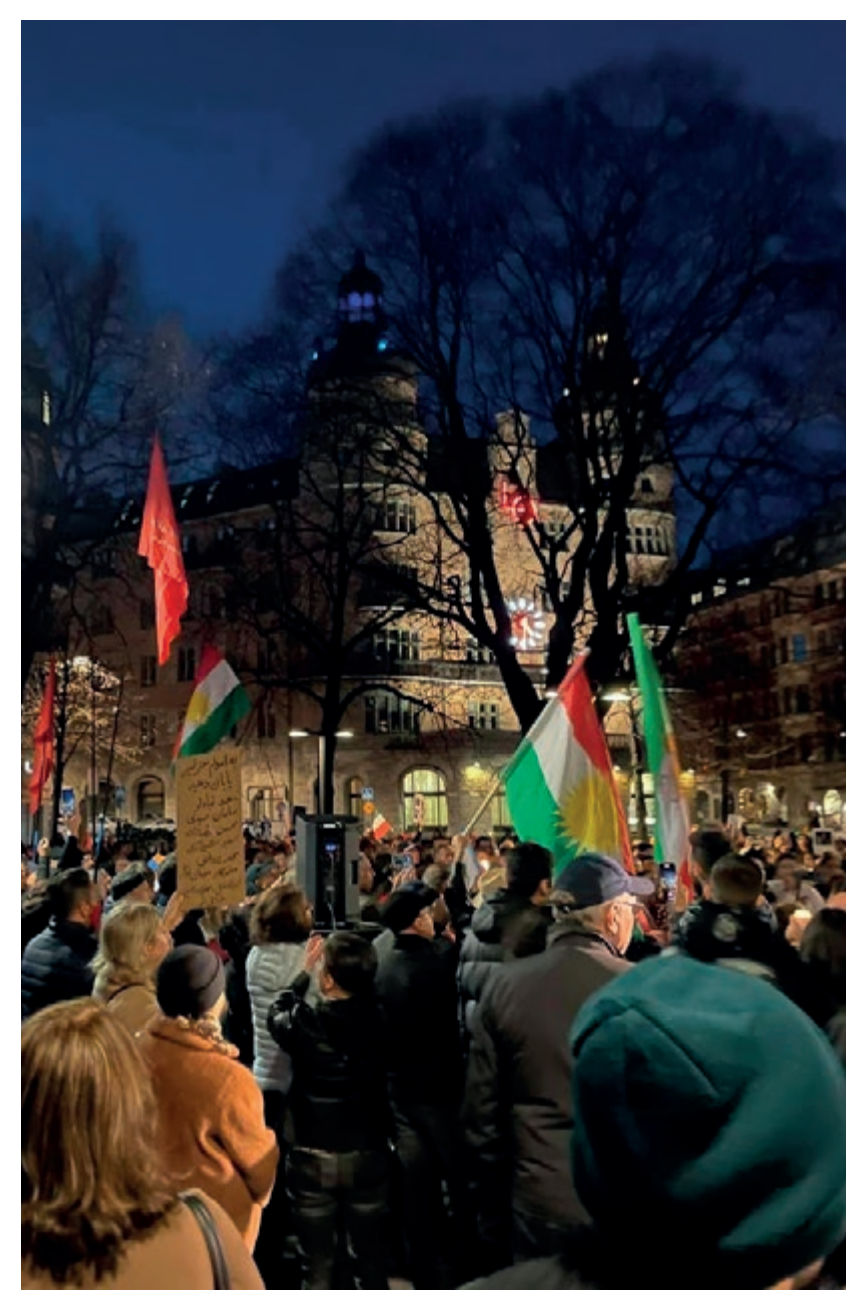
There have been a wide range of trade union manifestations in support of the fight against repression in Iran.